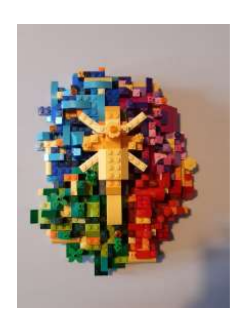
Examples of pictures and models shown in the zoom services Creative Space