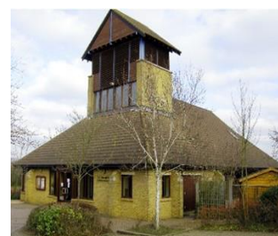
St Mary Magdalene