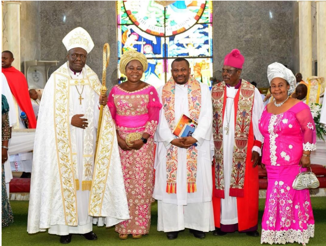
Chi's Canon service.