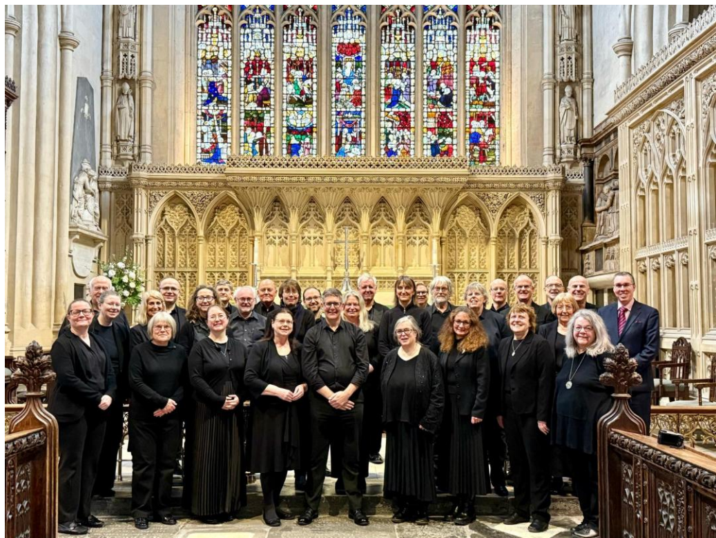
Quorum choir at Bath Abbey February 2025.